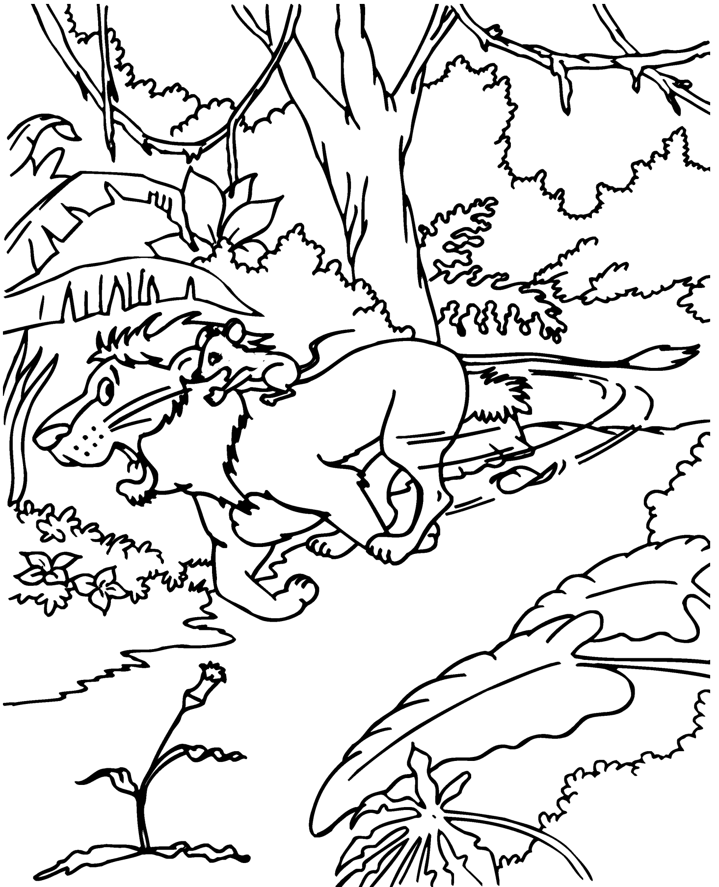
Bitsie and the lion run from the hunters.