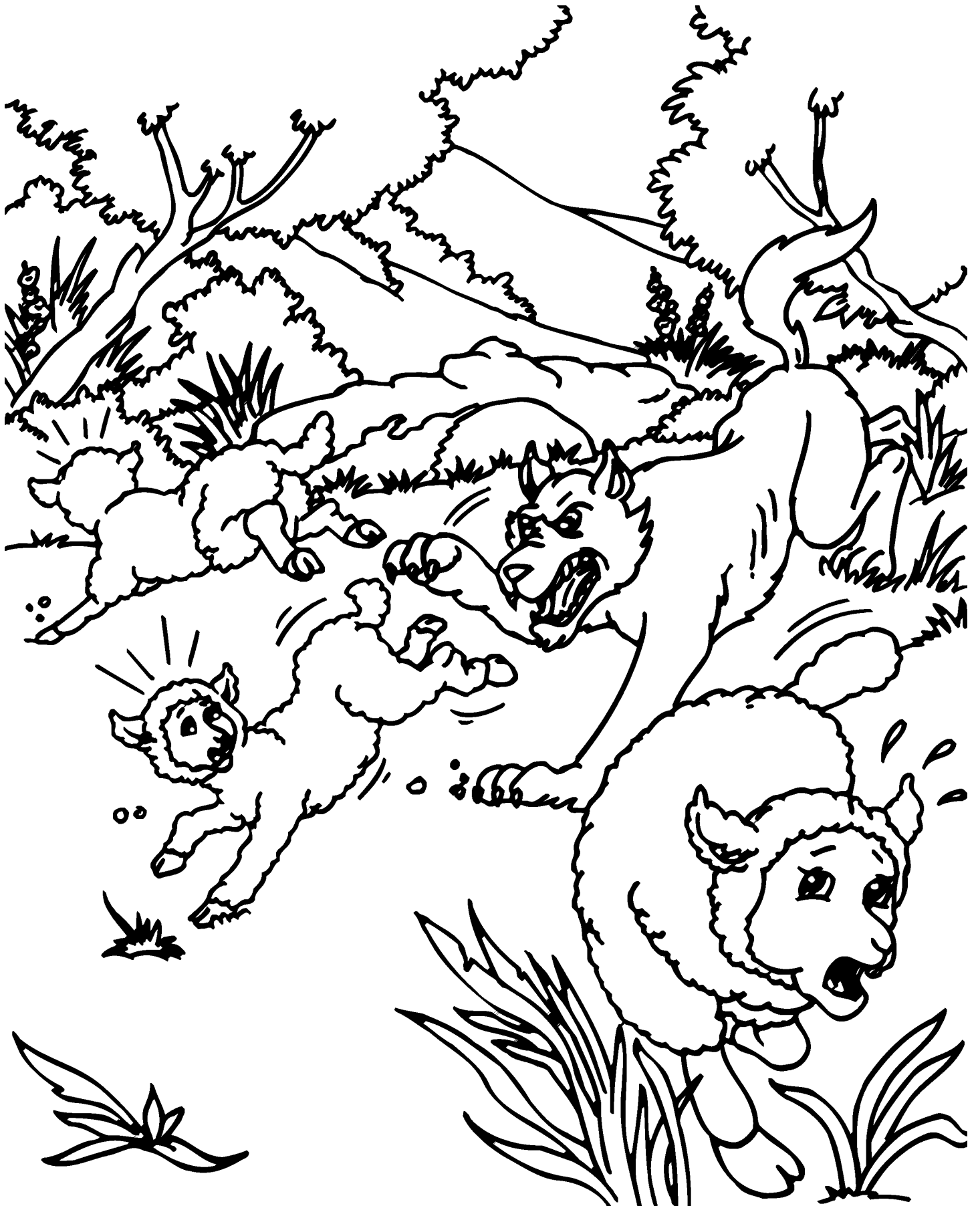
A wolf attacks the sheep.