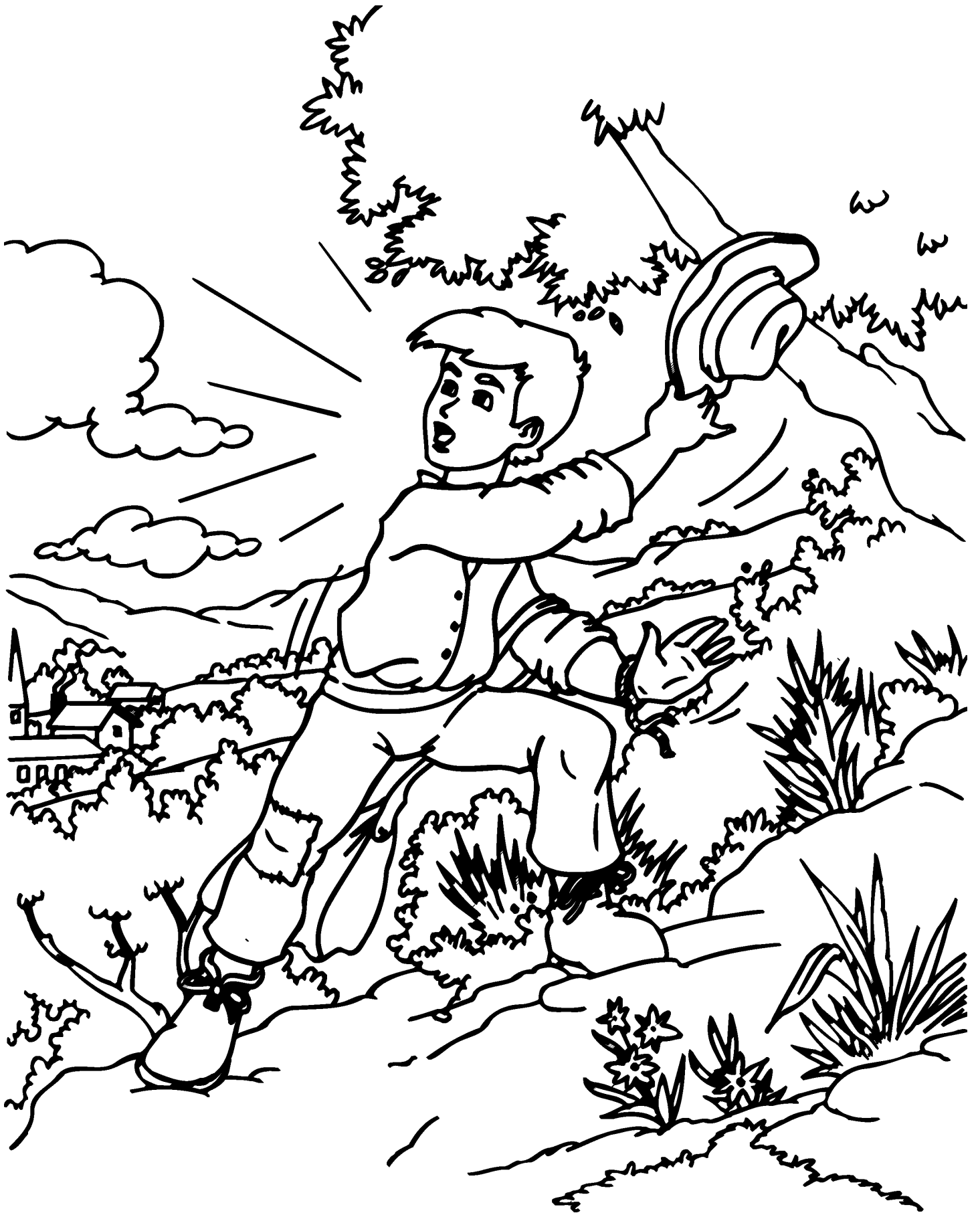
Nicholas calls for help.